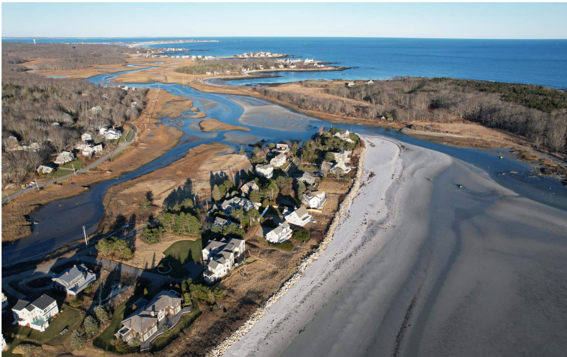
Looking north toward Biddeford Pool. The Little River runs across the center of the photo toward Goosefare Bay. In collaboration with the City of Biddeford, Kennebunkport will strive to eliminate pollution in the Little River.