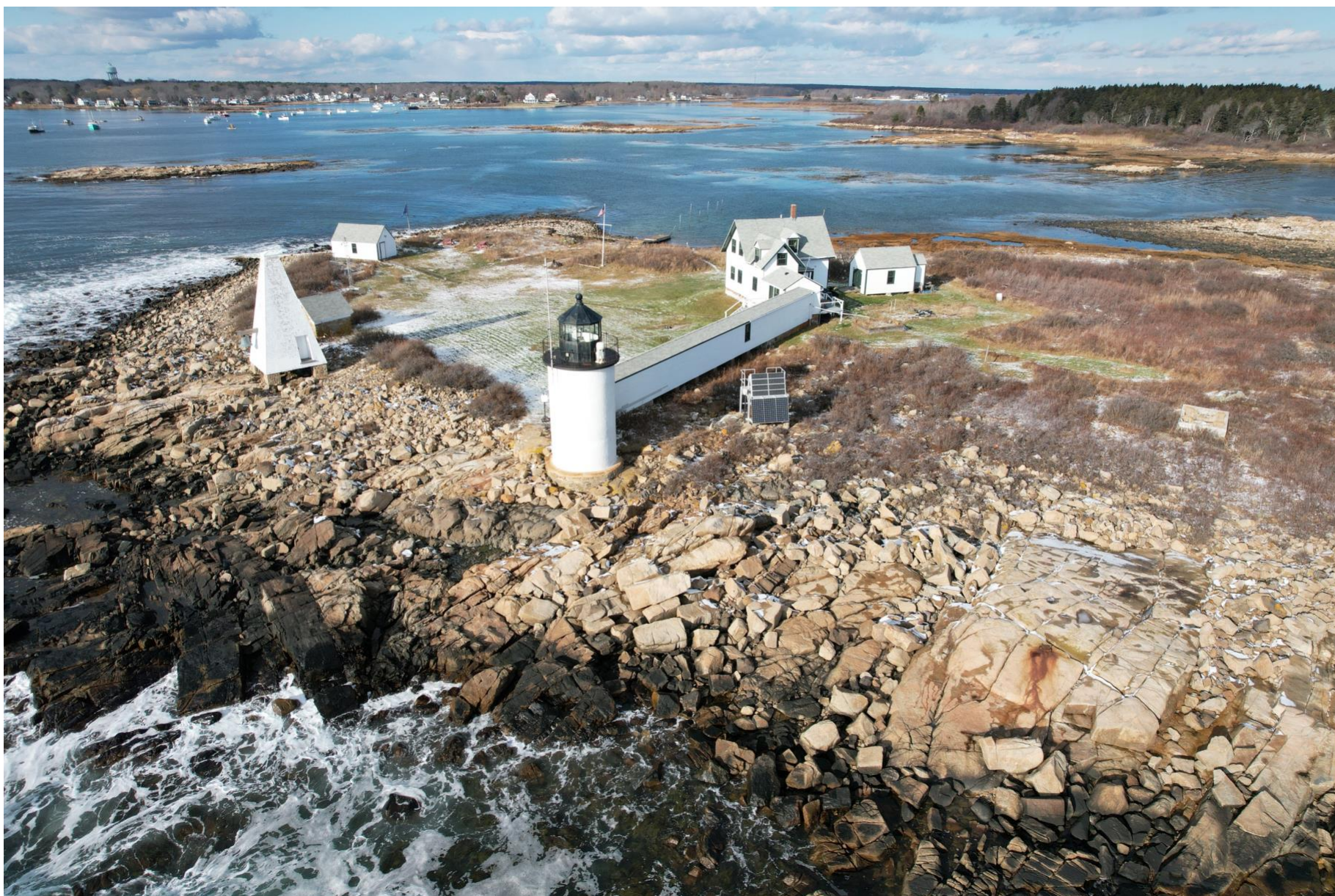
Goat Island Light has guided mariners in the vicinity of Cape Porpoise since 1859.