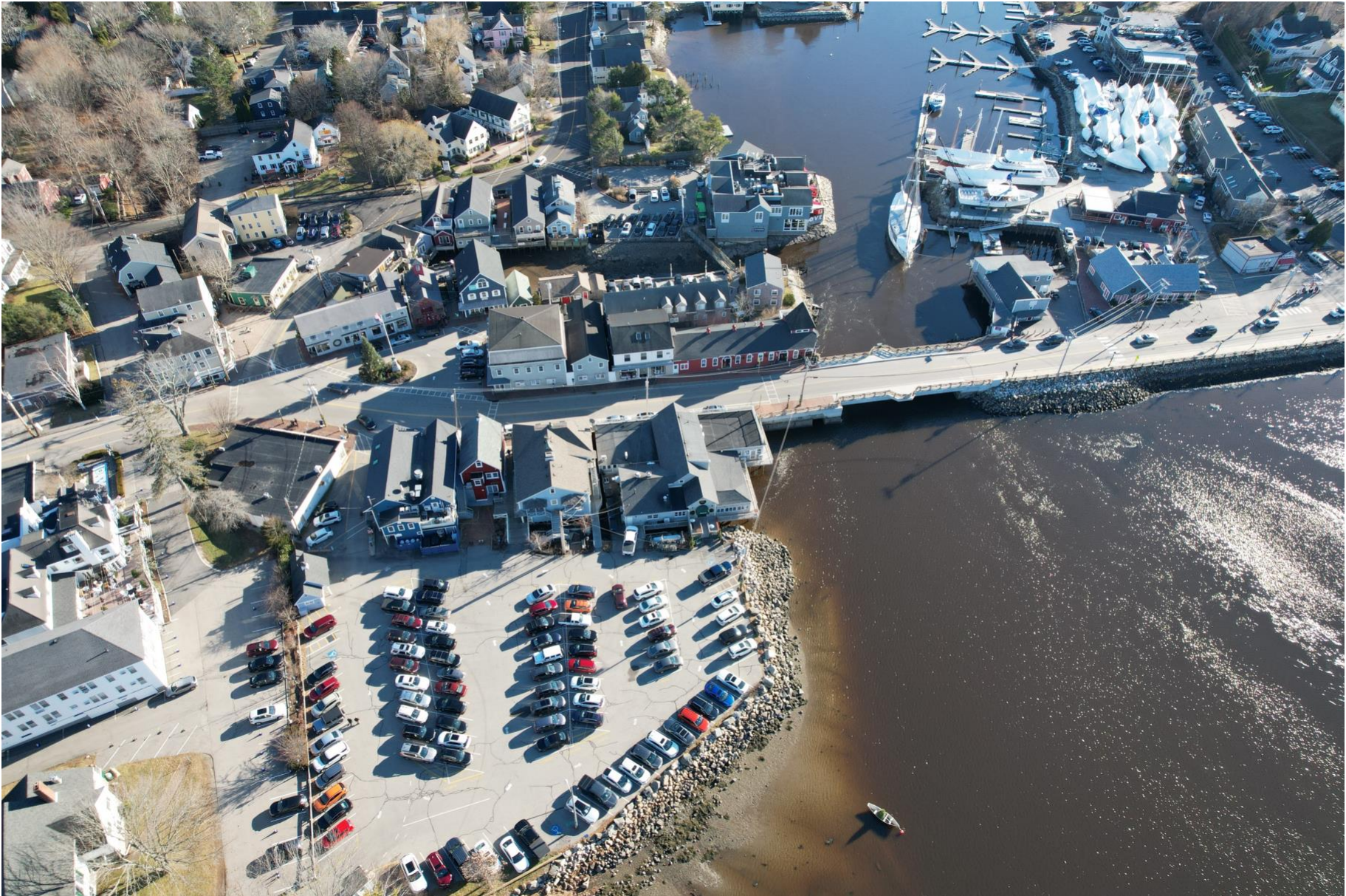
Dock Square has served as Kennebunkport's commercial center since the 18 th Century.