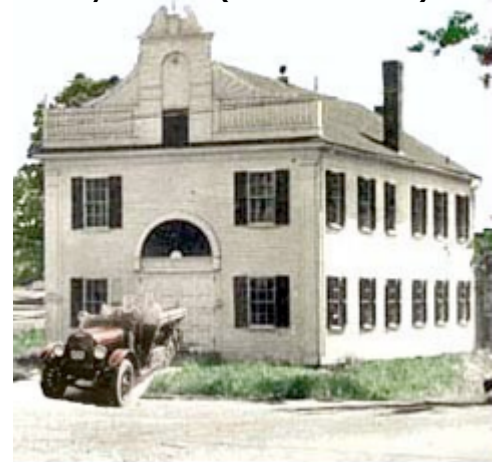
Atlantic Hall