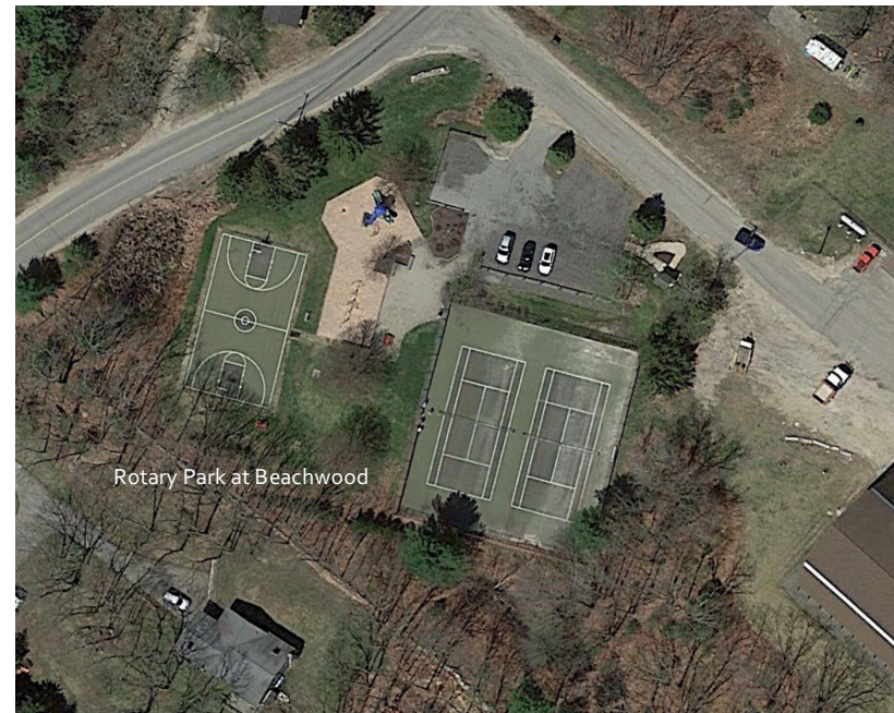
Figure 15-2 Aerial image of Parsons Field and adjacent Consolidated School and Kennebunkport Disc Golf course (left) and Aerial image of Rotary Park at Beachwood. This image was captured before the construction of the new recreation building