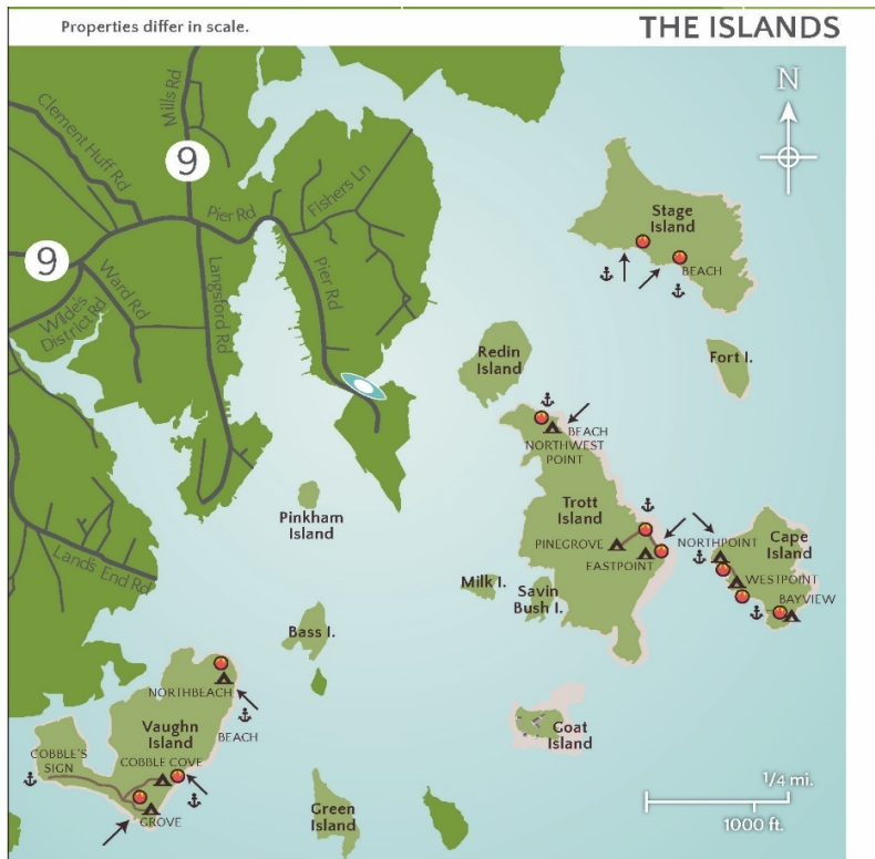
Figure 15-5 Camping locations on the islands

A DETAILED DESCRIPTION OF KCT TRAILS AND PRESERVES IS AVAILABLE AT: