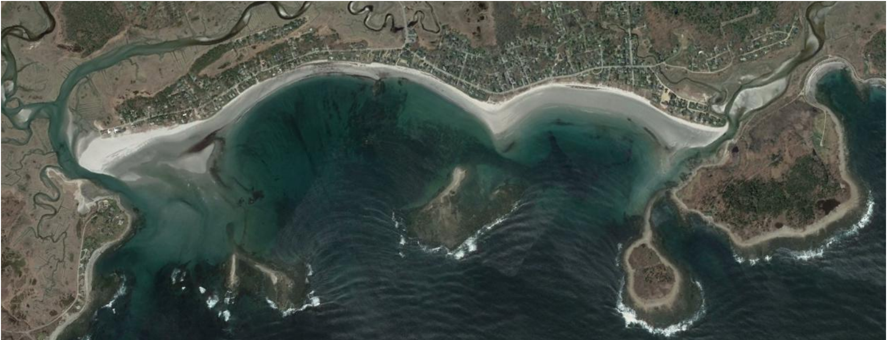
Figure 15-3 Aerial image of Goose Rocks Beach and Timber Point

One of the premiere recreational sites in Kennebunkport is Goose Rocks Beach (Figure 15-3). This beach is approximately two miles long and offers residents and visitors a range of passive recreational opportunities including sunbathing, swimming, paddle boarding, jogging and walking, fishing, cross country skiing, and horseback riding. Beachgoers can enjoy scenic views of the Atlantic and islands, birdwatching, and even spot harbor seals.