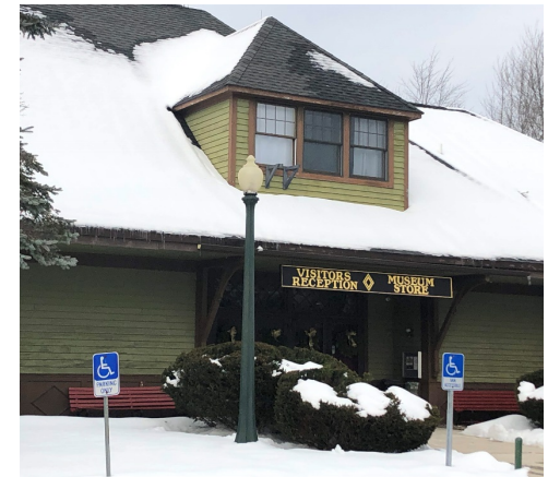
Trolley Museum

In addition to these resources, there are dozens of art galleries, restaurants, and shops in Kennebunkport and across the river in Kennebunk that provide opportunities for learning, enrichment, and leisure. Regional resources include movie theaters, YMCA, the Arundel Barn Playhouse, art museums, bowling alleys, indoor ice arenas, children’s museums, Portland’s Symphony Orchestra, concerts and state presentations, amusement parks, and professional sports events. 14 The Kennebunk-Kennebunkport-Arundel Chamber of Commerce provides a one stop shop for accommodations, recreational and cultural resources, and business events. The Chamber’s website hosts a detailed calendar with an extensive range of events and activities.